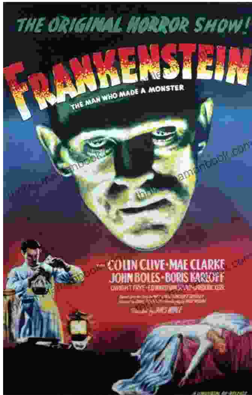
Frankenstein 1975 promotional poster