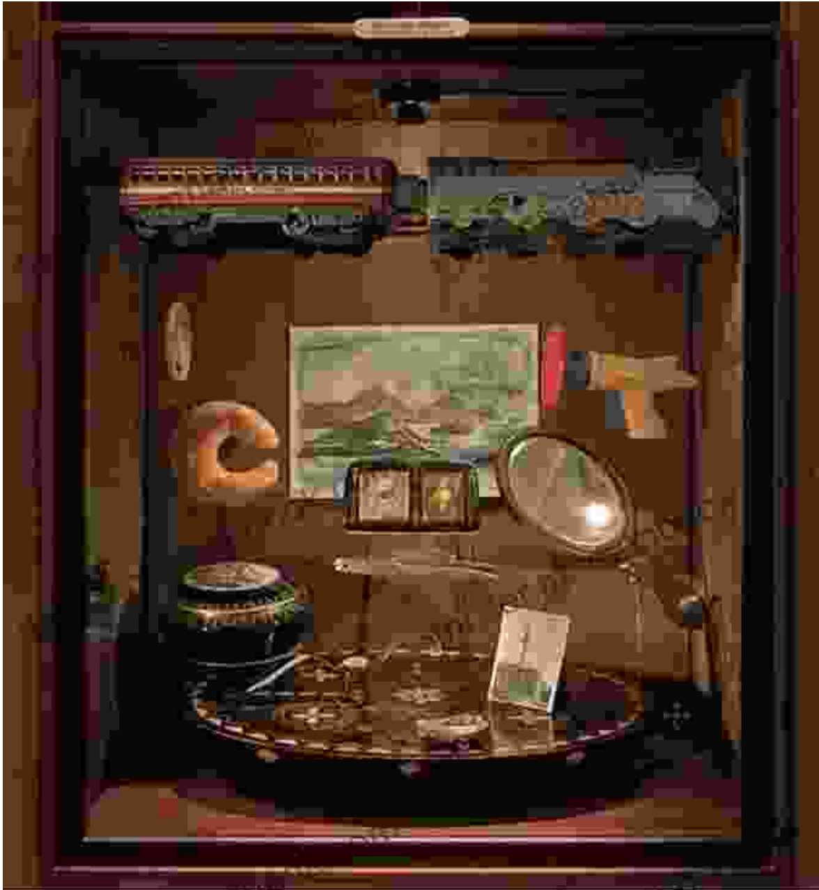
The dimly lit interior of The Museum of Innocence, evoking a sense of nostalgia and longing.