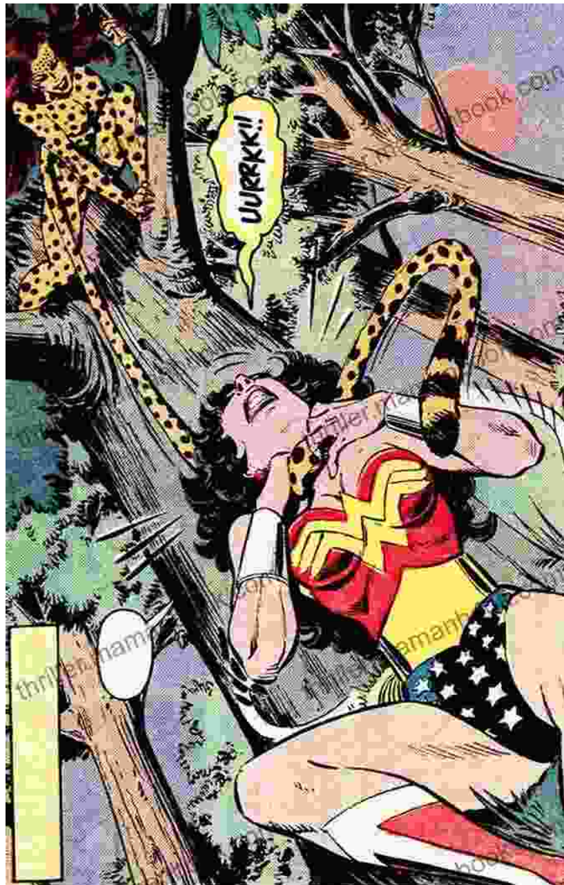
Wonder Woman fighting the Cheetah.